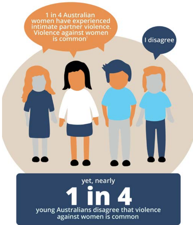
Knowledge of the prevalence of violence against women