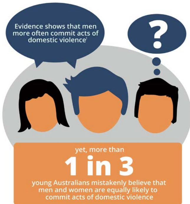
Knowledge of the gendered pattern of domestic violence

1 Since the age of 15, intimate partner includes current and former partners and people in dating relationships. Source: ABS 2017.