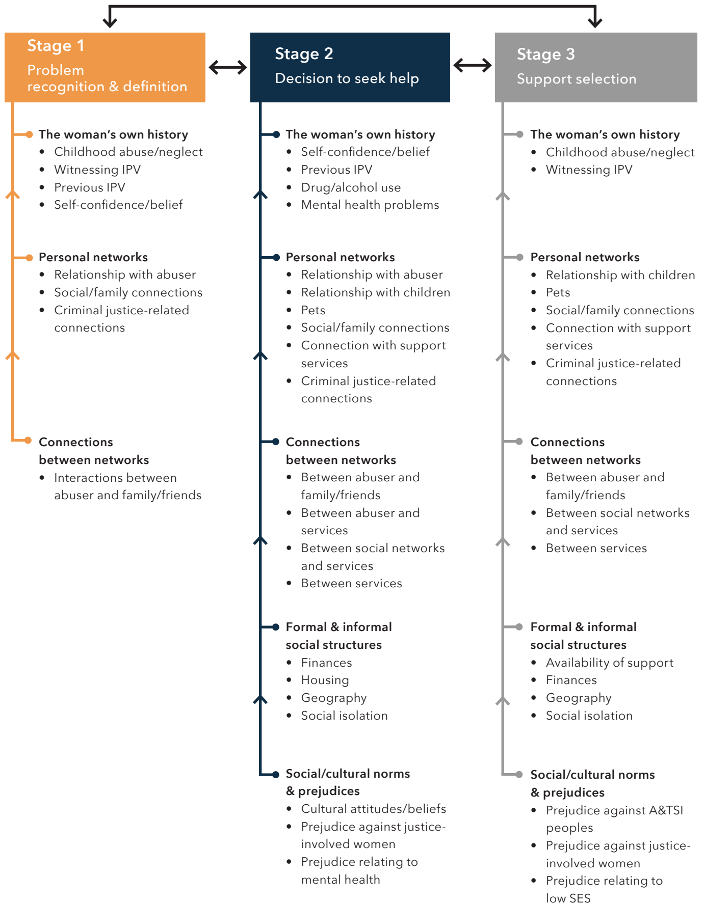
Figure 1 Model of help-seeking and change for women in prison

(Adapted from Day, Casey, Gerace, Oster, & O'Kane (2018).)